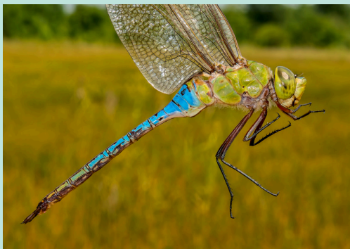
Common Green Darner, Male, Summit Bridge