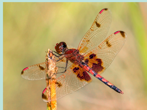
Calico Pennant, Male, Summit Bridge Ponds

TO LEARN MORE ABOUT THE PROJECT, VISIT DELAWARENATURALLY.ORG/DRAGONFLIES