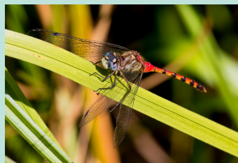
Blue-Faced Meadowhawk, Male, Lum's Pond State Park