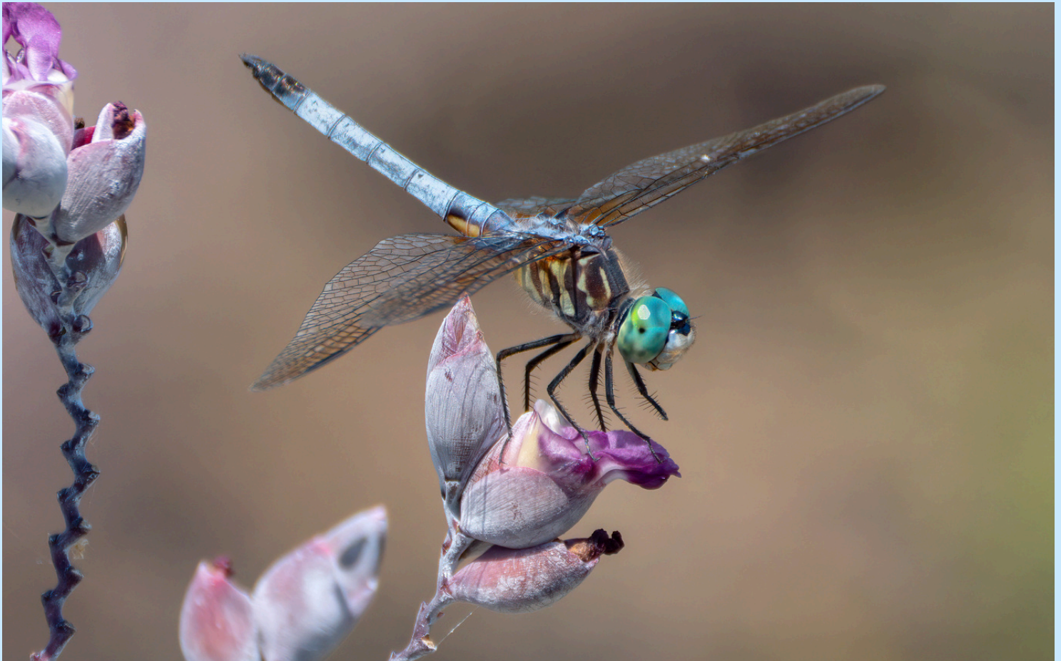
Male Blue Dasher, Glasgow, DE