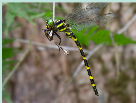
Tiger Spiketail, Male, White Clay Creek State Park

TO LEARN MORE ABOUT THE PROJECT, VISIT DELAWARENATURALLY.ORG/DRAGONFLIES