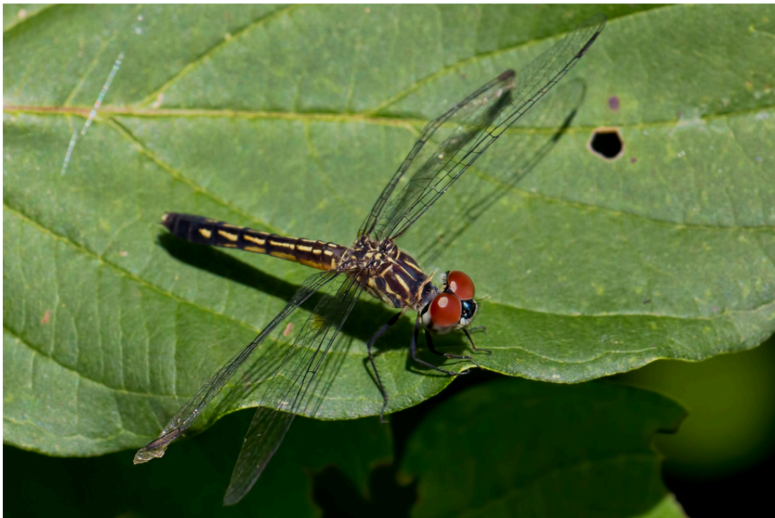
Female Blue Dasher, Summit Bridge, Middletown, DE

Hundreds of students made their case for which dragonfly species deserved designation as the official state dragonfly, and the Blue Dasher was selected as the winner through a voting period open to all Delaware students and teachers.