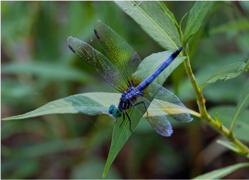
Male Blue Dasher, Lums Pond State Park, DE